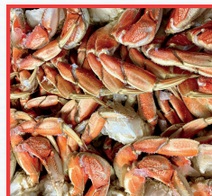
SNOW OR DUNGENESS CRAB $15.00/LB