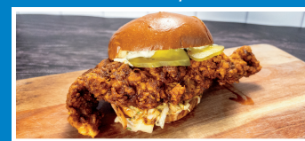
NASHVILLE "HELL CAT" Hot-fried Wild Chesapeake Blue Catfish, Nashville-style with slaw, ranch, bread & butter pickles, hot sauce, on a brioche bun $12.00/EA