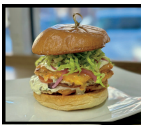
DOUBLE SMASH SALMON BURGER $10.00/EA