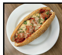
TUNA MEATBALL SUB $5.00/EA