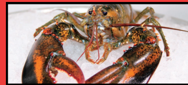
LIVE LOBSTERS- ANY SIZE $15.00/LB