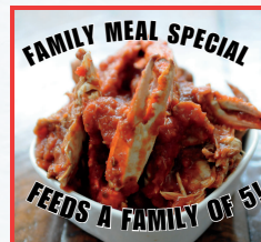
FAMILY MEAL SPECIAL FEEDS A FAMILY OF 5! RED CRAB GRAVY, BLUE CRAB, WHITE CRABMEAT & 1 LB SPAGHETTI $25.00