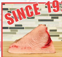
HOUSE-CUT SWORDFISH LOINS $19.26/LB