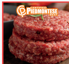
GRASS-FED BEEF 8 OZ HAMBURGERS 4 FOR $25.00