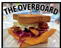
CRISPY FLUKE SANDWICH W/ SLAW, FRIES, & PICKLED CABBAGE $10.00/EA