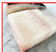
WILD SKIN-ON HALIBUT FILLETS $19.26/LB