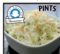
POTATO SALAD OR COLESLAW $5.00/EA