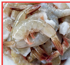
16/20 TROPICAL WHITE SHRIMP $10.00/2 LB BAG