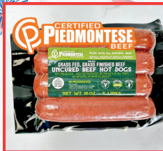
1 LB PACK OF GRASS-FED ALL BEEF HOT DOGS $5.00/EA