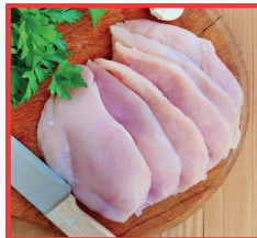
1 LB PACK OF CHICKEN CUTLETS $5.00