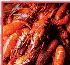
COOKED & SEASONED CRAWFISH $10.00/5 LB BAG