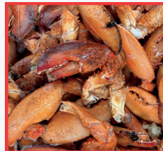
COOKED & CRACKED LOBSTER CLAWS 6/9 COUNT $10.00/LB