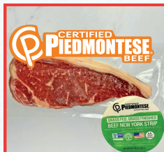
10 OZ GRASS-FED STRIP STEAK $20.00/EA