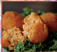
SHRIMP VOLCANOES $2.50/EA