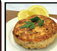
SALMON 'BURGER' PATTIES $5.00/2