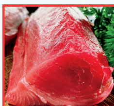
#1 TUNA SKIN-OFF LOINS $19.26/LB