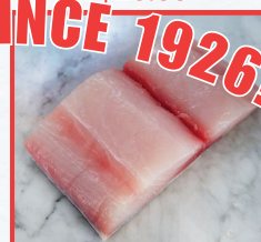
WILD SKIN-OFF MAHI-MAHI $19.26/LB