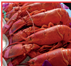
FRESH 1 LB STEAMED LOBSTERS $10.00/EA