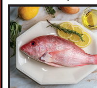
WHOLE RED SNAPPER $6.99/LB

PRICING AND AVAILABILITY SUBJECT TO CHANGE THROUGH 7/8/26. VALID ONLY FOR IN-STORE SHOPPING AND ACCOUNT HOLDER/SEVEN FISH CLUB MEMBER DELIVERIES.