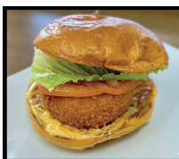
THE CRAB CAKE SAMMY $10.00/EA