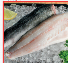
BRONZINO FILLETS $10.00/LB