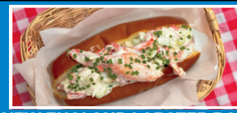
NEW ENGLAND LOBSTER ROLL Fresh-steamed lobster, hand-picked and piled onto locally baked rolls $25.00/EA