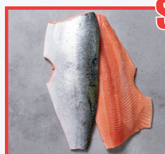
FRESH AKAROA KING SALMON FILLETS $19.26/LB