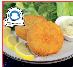
THE CITY'S BEST FISH CAKES $5.00/DZ