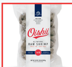
ALL-NATURAL JUMBO 16/20 COUNT SHRIMP $19.26/2 LB BAG