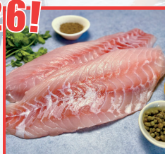
FRESH SKIN-OFF GROUPEL FILLETS $19.26/LB