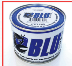
CLAW CRABMEAT $10.00/16 OZ