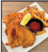
JUMBO FRIED SHRIMP & FRIES COMBO