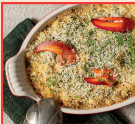
HOMEMADE LOBSTER MAC & CHEESE