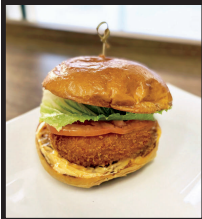
LUMP CRAB CAKE SANDWICH