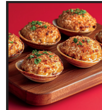
GIANT STUFFED CLAMS