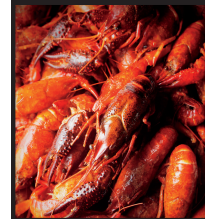
WHOLE COOKED CRAWFISH

3400 South Lawrence St (215) 389-8906 GiuseppesMarket.com