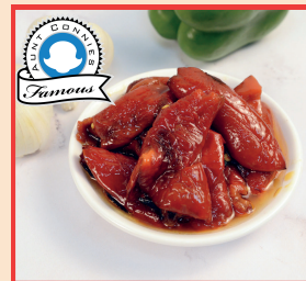
AUNT CONNIE'S ROASTED RED PEPPERS