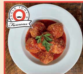
UNCLE TONY'S TUNA MEATBALLS