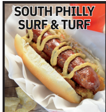
HOT DOG, FISH CAKE, MUSTARD, & KRAUT

1300 Dickinson St (215) 389-8906 IppolitosSeafood.com