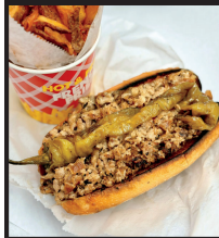
AHI TUNA CHEESESTEAK SANDWICH