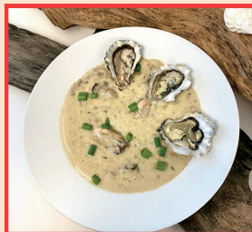
CALIFORNIA OYSTER STEW