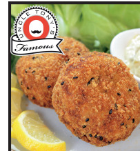
SPICY TUNA CAKES