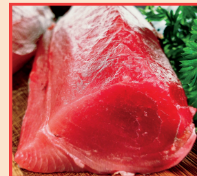
#1 TUNA SKIN-OFF LOINS