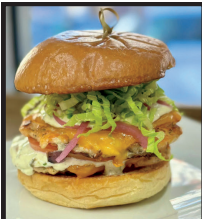
DOUBLE SMASH SALMON BURGER