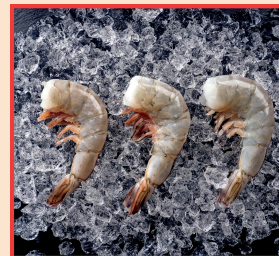
ALL-NATURAL JUMBO 16/20 COUNT SHRIMP