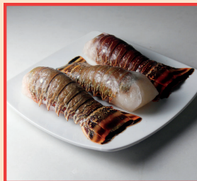
1 LB+ WARM WATER LOBSTER TAILS