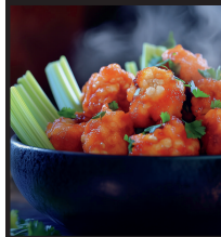
BUFFALO SHRIMP DINNER