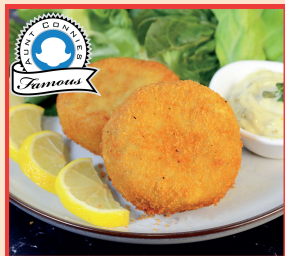
AUNT CONNIE'S FISH CAKES