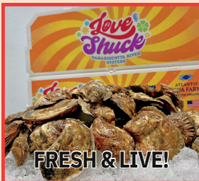
LOVE SHUCK OYSTERS