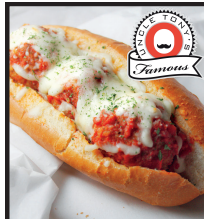
TUNA MEATBALL SUB