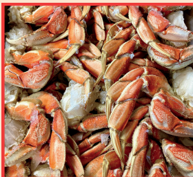
DUNGENESS CRAB CLUSTERS