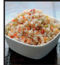
HOMEMADE PEPPER HASH