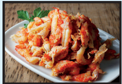
1 LB PACK OF COOKED CRAWFISH TAIL MEAT $5.00/EA