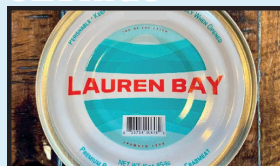
16 OZ LAUREN BAY® CLAW CRABMEAT 3 for $20.00