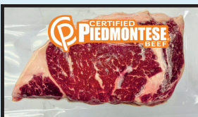
12 OZ GRASS-FED RIBEYE STEAK $15.00/EA