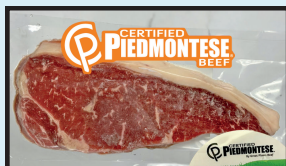
10 OZ GRASS-FED NY STRIP STEAK $15.00/EA