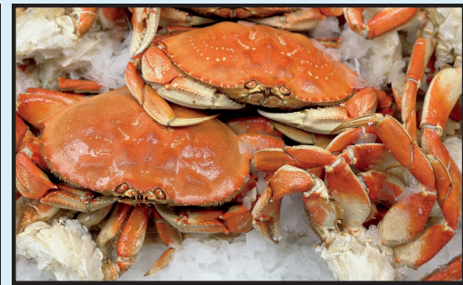
1.5 - 2 LB COOKED WHOLE DUNGENESS CRAB $15.00/EA