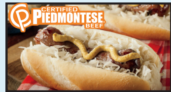
1/4 LB HOT DOG WITH SAUERKRAUT & MUSTARD $1.00/EA*