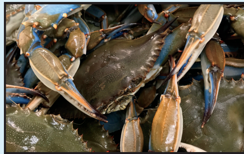
#1 MALE LIVE HARD-SHELL CRABS $199.00/BU

BUY A BUSHEL OF #1 MALE CRABS & GET A FREE WATERMELON