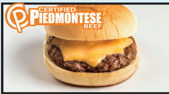
BROILED 1/4 LB GRASS-FED CHEESEBURGER $1.00/EA*