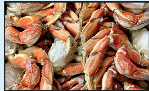
DUNGENESS CRAB CLUSTERS 25 LB CASE $15.00/LB