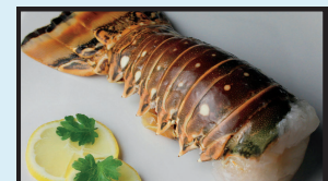
JUMBO LOBSTER TAILS (1 LB+) $20.00/EA

ALL PRICES AND AVAILABILITY SUBJECT TO CHANGE THROUGH 8/20/25.