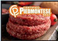
2 PACK OF 8 OZ BEEF BURGER PATTIES $5.00/EA