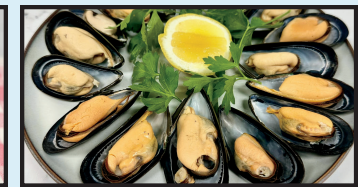
COOKED MUSSELS ON THE HALF SHELL 10 FOR $5.00*