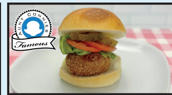
AUNT CONNIE'S FISH CAKE ON A CACIA'S ROLL $1.00/EA*