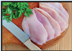
1 LB PACK OF CHICKEN CUTLETS $5.00/EA