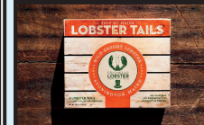
4-PACK OF 4-5 OZ LOBSTER TAILS $15.00/EA