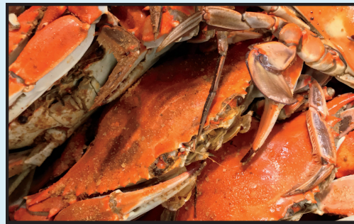
JUMBO STEAMED CRABS 5 FOR $20.00