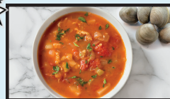
MANHATTAN CLAM CHOWDER $10.00/QT