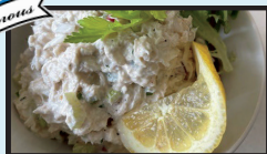
FRESH CRAB SALAD $10.00/QT