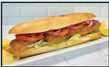
CHEF-CRAFTED FISH HOAGIE