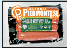
4 PACK OF 1/4 LB ALL-BEEF HOT DOGS $5.00/EA