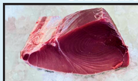
BLUEFIN OR YELLOWFIN TUNA LOINS $15.00/LB