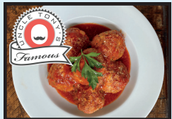
UNCLE TONY'S TUNA MEATBALLS 3 FOR $5.00