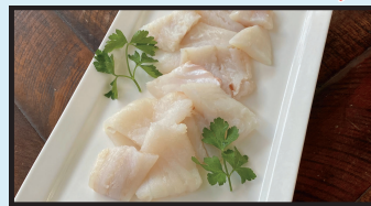
PET-FRIENDLY BUFFET-CUT COD $1.00/LB*