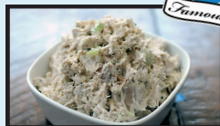
FRESH TUNA SALAD $10.00/QT