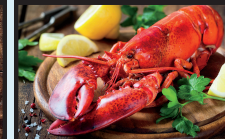
FRESH STEAMED LOBSTERS $15.00/EA