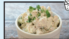
FRESH CHICKEN SALAD $10.00/QT