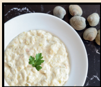
NEW ENGLAND CLAM CHOWDER $15.00/QT