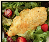
STUFFED CHICKEN BREAST $15.00 (3)