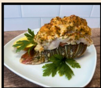
STUFFED LOBSTER TAIL $10.00/EA