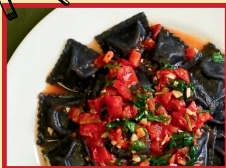
BLACK SQUID INK RAVIOLI $10.00 (20)