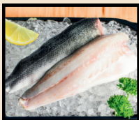
SKIN-ON BRONZINO FILLET $10.00/LB