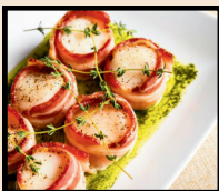
BACON- WRAPPED SCALLOPS $15.00 (6)