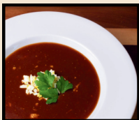
HOMEMADE SNAPPER SOUP $10.00/QT