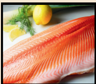
KING SALMON FILLET $20.00/LB