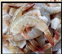
FARMED WHITE SHRIMP $10.00/BOX