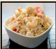
MEDITERRANEAN SEAFOOD SALAD $10.00/QT