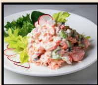
FRESH SALMON SALAD $10.00/QT