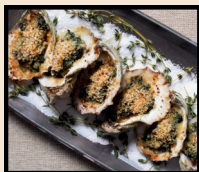
OYSTERS ROCKEFELLER $15.00 (6)