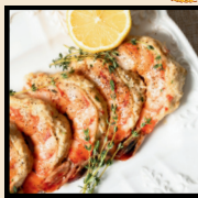
STUFFED SHRIMP $10.00 (2)