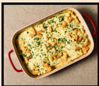
RED OR WHITE SEAFOOD LASAGNA $15.00/TRAY