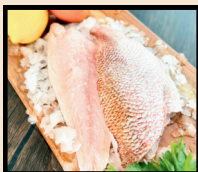
RED SNAPPER FILLET $10.00/LB