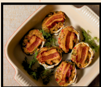
HOMEMADE CLAMS CASINO $15.00 (6)