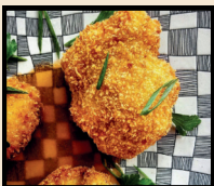
MEMPHIS- STYLE FRIED MONKFISH $15.00 (10)