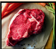
GRASS-FED BEEF RIBEYE (1LB AVG) $15.00/EA