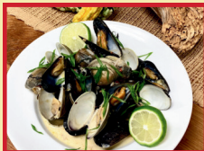
LIVE BLACK MUSSELS $10.00/2LB BAG