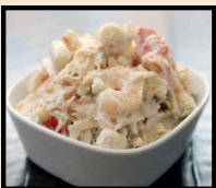
SEAFOOD AMERICAN SALAD $10.00/QT

PRICES AND AVAILABILITY SUBJECT TO CHANGE THROUGH 11/27/24