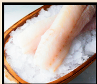
WILD COD LOINS $15.00/LB