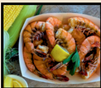
FRESH COOKED & SEASONED SHRIMP $10.00/LB