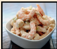
ALL SHRIMP SALAD $20.00/QT