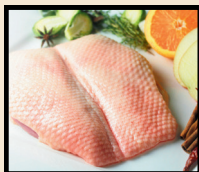
FRESH DUCK BREAST $15.00/LB