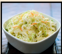
HOMEMADE COLESLAW $10.00/QT