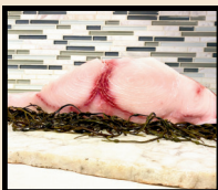
HOUSE-CUT SWORDFISH LOINS $20.00/LB