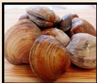
LIVE LITTLENECK CLAMS $10.00 (50)