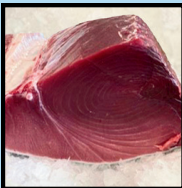
SUSHI-GRADE TUNA LOIN $20.00/LB

Tuna Tuesdays Tuna Meatballs, Tuna Tripe, & Tuna Chili $15.00/QT BUY 2 QUARTS, GET 1 FREE