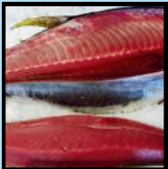
HOUSE-CUT YELLOWFIN TUNA $10.00/LB