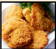
FRIED OYSTERS $15.00 (6)