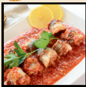
STUFFED SARDINES $10.00 (10)