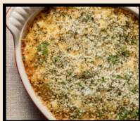
LOBSTER MAC & CHEESE $20.00/TRAY