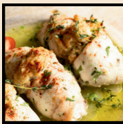
STUFFED FLOUNDER $10.00 (2)