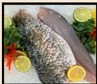
BARRAMUNDI SKIN-ON FILLET $10.00/LB