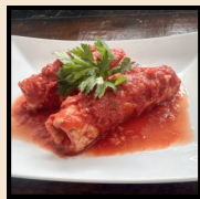
SWORDFISH BRACIOLE $10.00 (2)