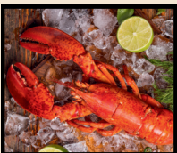
FRESH STEAMED LOBSTERS $10.00/EA