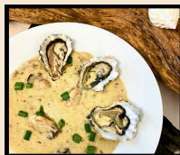
CALIFORNIA OYSTER STEW $10.00/QT