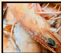
WILD AUSTRALIAN HEAD-ON PRAWNS $10.00/LB