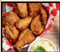
MEMPHIS- STYLE FRIED CHICKEN $15.00 (10)