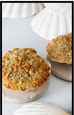
SHRIMP & CRAB STUFFED SCALLOPS 2/$10.00