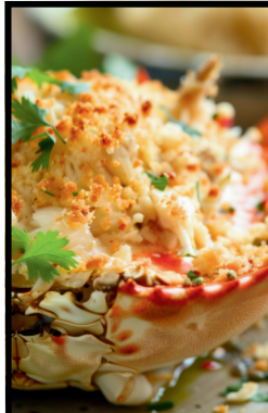
STUFFED CRAB IMPERIAL 2/$10.00