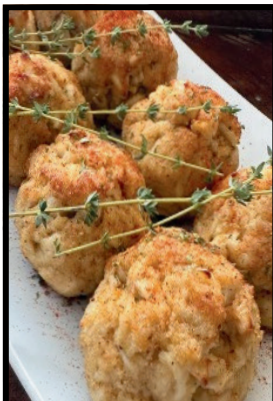
JUMBO LUMP CRAB CAKES $10.00/EA