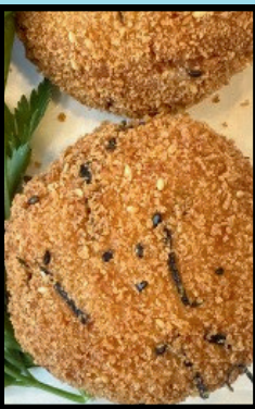
SPICY TUNA CAKES $1.00/EA