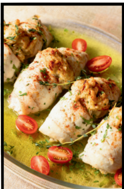
CRAB STUFFED FLOUNDER 2/$10.00