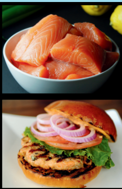
SALMON BUFFET CUT OR SALMON 'BURGER' $1.00/EA

THE ABOVE ITEMS ARE AVAILABLE IN-STORE ONLY DURING BUSINESS HOURS FOR $1 ON 8/19/24 AND $2 ON 8/20/24. $50 PURCHASE LIMIT PER CUSTOMER.