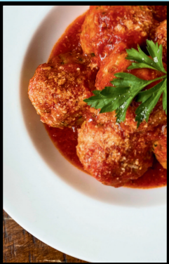
UNCLE TONY'S TUNA MEATBALLS $1.00/EA