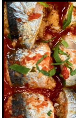
STUFFED FRESH SARDINES $10.00/EA

PRICES AND AVAILABILITY SUBJECT TO CHANGE THROUGH 8/21/24.