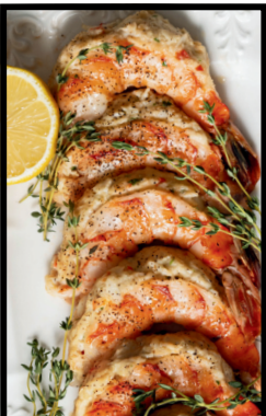
CRAB STUFFED SHRIMP 2/$10.00