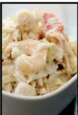
DELUXE SEAFOOD SALAD $10.00/QT