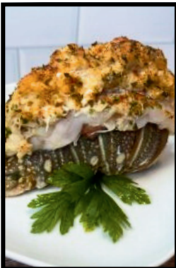
CRAB STUFFED LOBSTER TAIL $10.00/EA