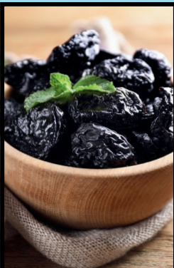
DRIED SUGAR PLUMS $1.00/EA