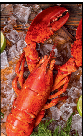
FRESH STEAMED LOBSTERS $10.00/EA