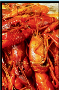
COOKED CRAWFISH $1.00/LB