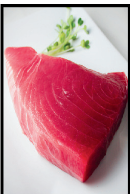
SUSHI-GRADE TUNA $20.00/LB