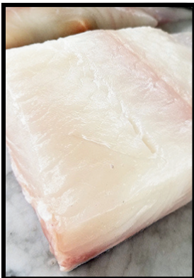
WILD CAUGHT HALIBUT $20.00/LB