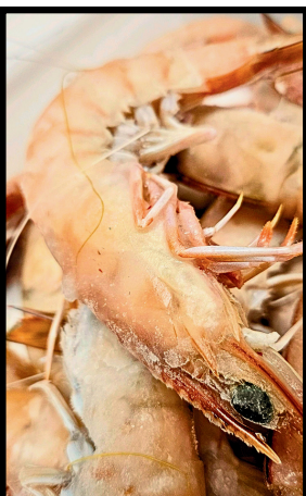
WILD AUSTRALIAN HEAD-ON PRAWNS $10.00/LB