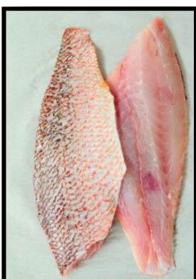
RED SNAPPER FILLET $20.00/LB