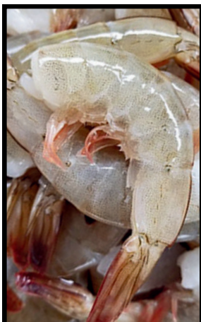
FROZEN WHITE SHRIMP $10.00/BOX

THE ABOVE ITEMS ARE AVAILABLE IN-STORE ONLY DURING BUSINESS HOURS FOR $1 ON 8/19/24 AND $2 ON 8/20/24. $50 PURCHASE LIMIT PER CUSTOMER.