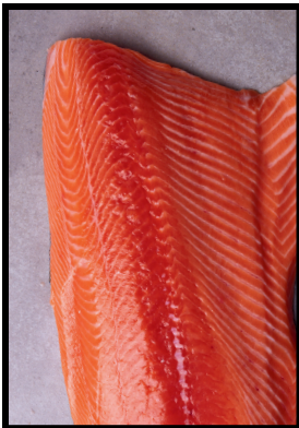
KING SALMON FILLET $20.00/LB