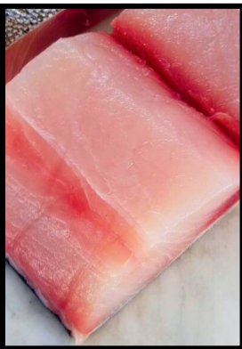
WILD CAUGHT MAHI MAHI $20.00/LB