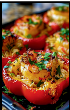
SHRIMP STUFFED PEPPERS 2/$10.00