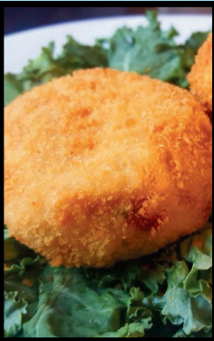
AUNT CONNIE'S FISH CAKES $1.00/EA