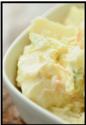
POTATO SALAD $10.00/QT