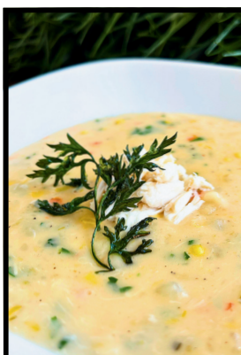
HOMEMADE CRAB & CORN CHOWDER $10.00/QT