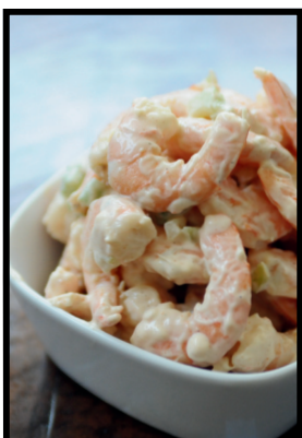
ALL SHRIMP SALAD $10.00/QT