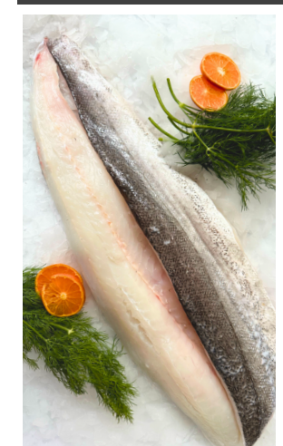
SILVER TROUT FILLETS $2.00/LB