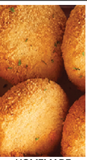
HOMEMADE CRAB CAKES $6.00/EA