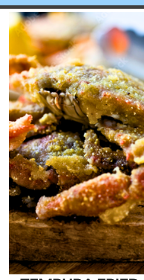
TEMPURA FRIED SOFT SHELL CRABS $6.00/ORDER + SIDE OF COLESLAW