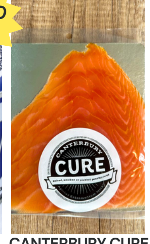
CANTERBURY CURE SMOKED SALMON $10.00/PKG