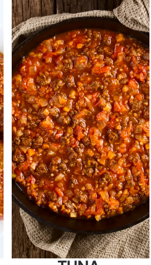
TUNA BOLOGNESE W/ A FREE LB OF PASTA $10.00/EA