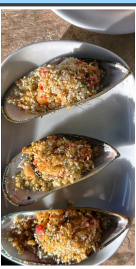
SICILIAN MUSSELS CASINO 6 FOR $5.00