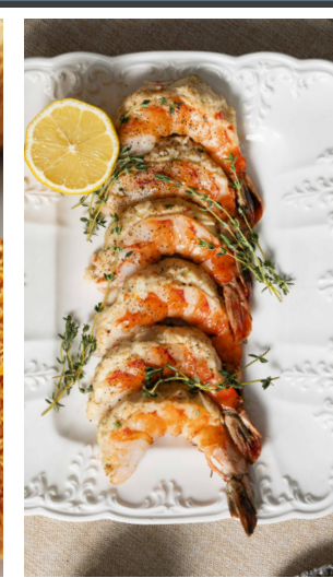
CRAB STUFFED SHRIMP $6.00/EA 12 FOR $60.00