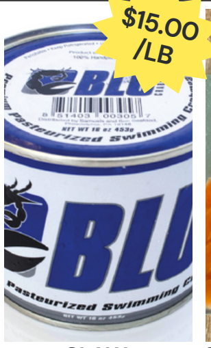
CLAW CRABMEAT $15.00/LB