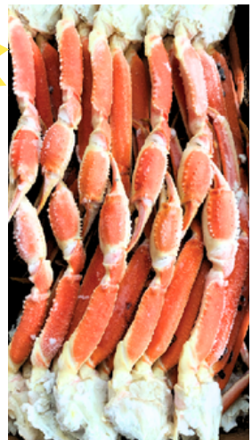
SNOW CRAB LEGS $10.00/LB