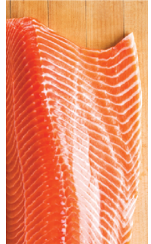
CANADIAN ATLANTIC SALMON FILLET $10.00/LB