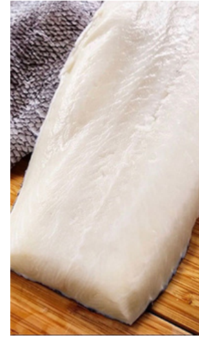
CHILEAN SEA BASS FILLET $20.00/LB