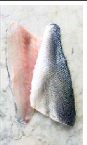
MEDITERRANEAN BRONZINO FILLET $10.00/LB