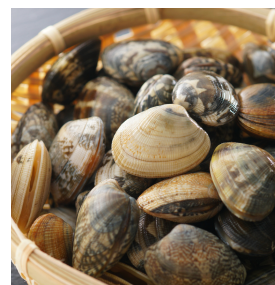
50 CLAMS ANY SIZE $20.00/BAG