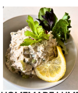
HOMEMADE LUMP CRAB SALAD $10.00/QT