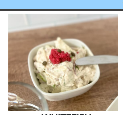
WHITEFISH SALAD $10.00/PT