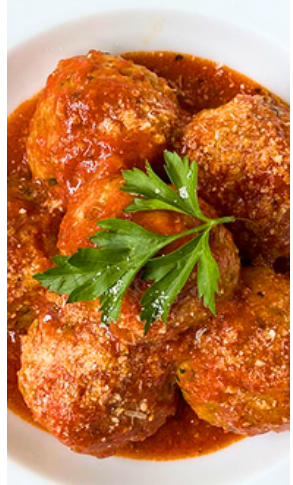
UNCLE TONY'S TUNA MEATBALLS W/ A FREE LB OF PASTA $10.00/QT