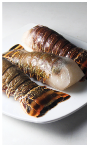
LOBSTER TAILS NO LIMIT! $5.00/EA