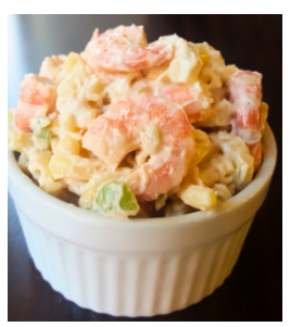
ALL SHRIMP SALAD $10.00/QT