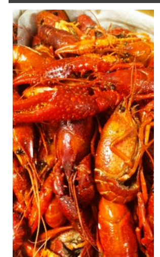
COOKED WHOLE CRAWFISH $2.00/LB