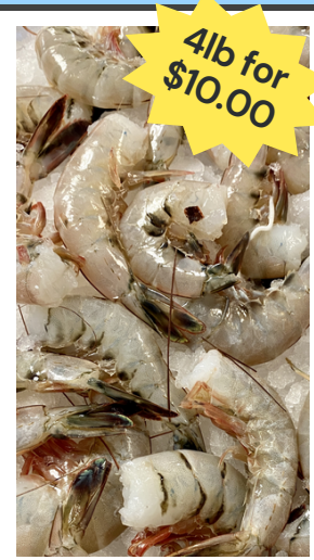
WILD CAUGHT WHITE SHRIMP 4LB FOR $10.00