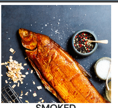
SMOKED WHITEFISH $10.00/LB