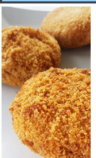
HOMEMADE FISH CAKES $2.00/EA 12 FOR $15.00