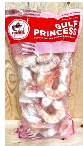
COOKED SHRIMP TAIL ON 2LB FOR $15.00